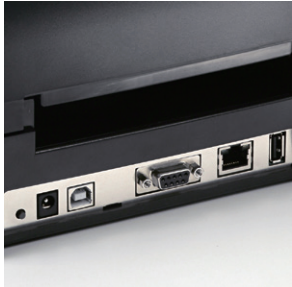
Ethernet, USB 2.0, Serial and USB host are standard features adding flexibility and power