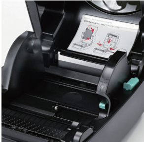
Rod-less label roll holder for easy loading and smooth feeding