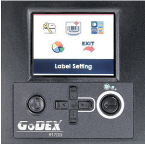
Color TFT LCD and operation panel for easy and intuitive operation

Full functions, powerful features, user friendly interface and high extensibility make the RT700i perfect for retail and industrial applications