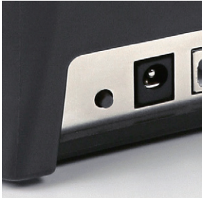
Innovative "C" button makes label Calibration simple and fast